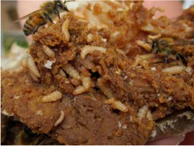
Small hive beetle larvae in pollen patty.

If small hive beetles are present they like to lay their eggs in the patties. This is good. Remove and freeze the patty, then feed it to the birds, chickens, etc. Do not throw it on the ground; that would aid the small hive beetles' metamorphosis process.